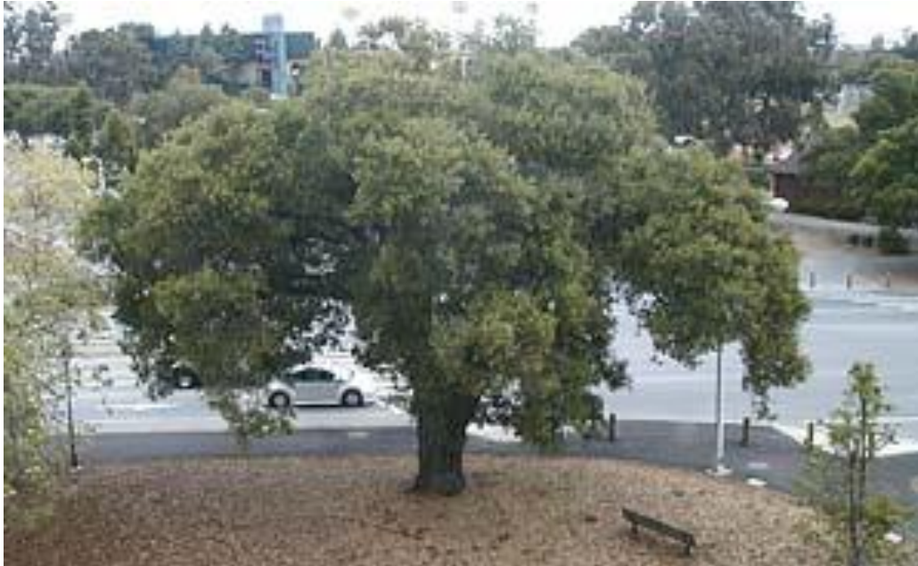
Quercus agrifolia Coastal Live Oak