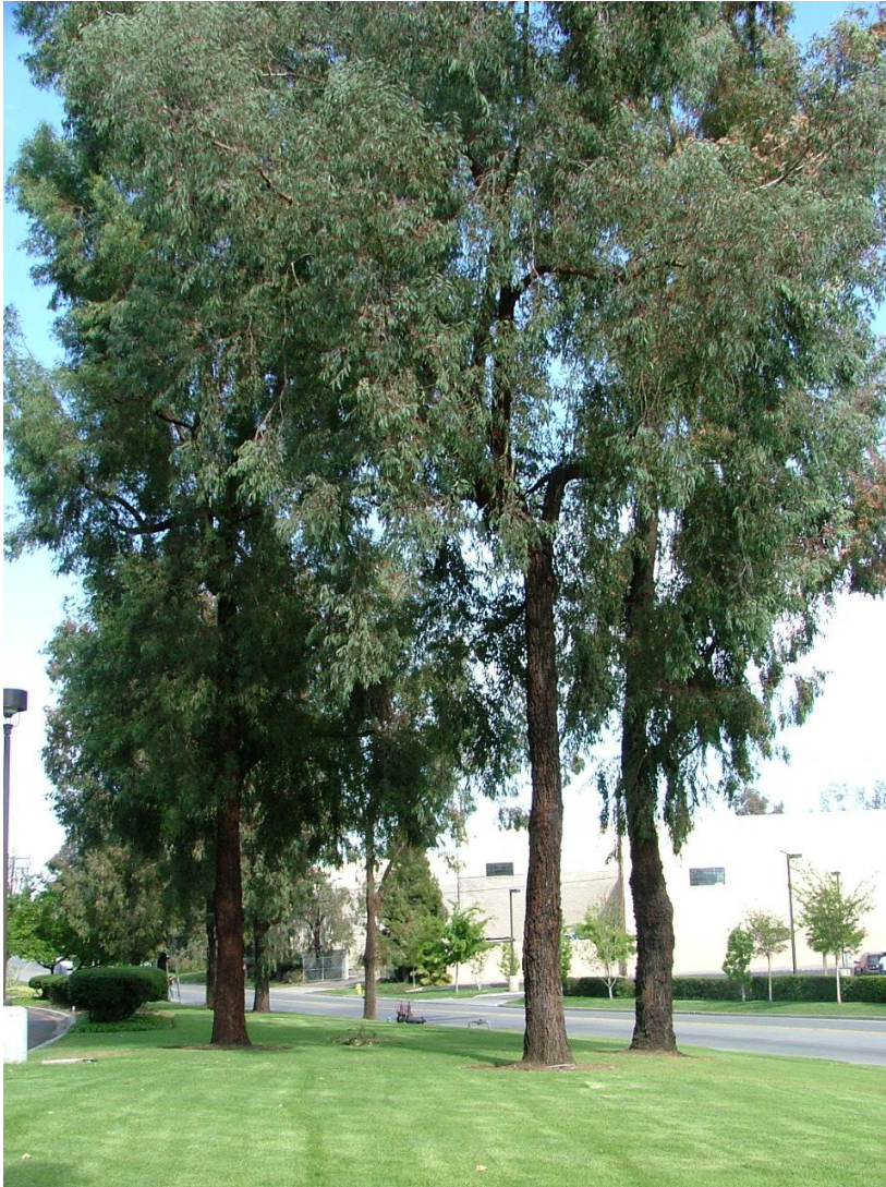
Eucalyptus sideroxylon Red Iron-Bark