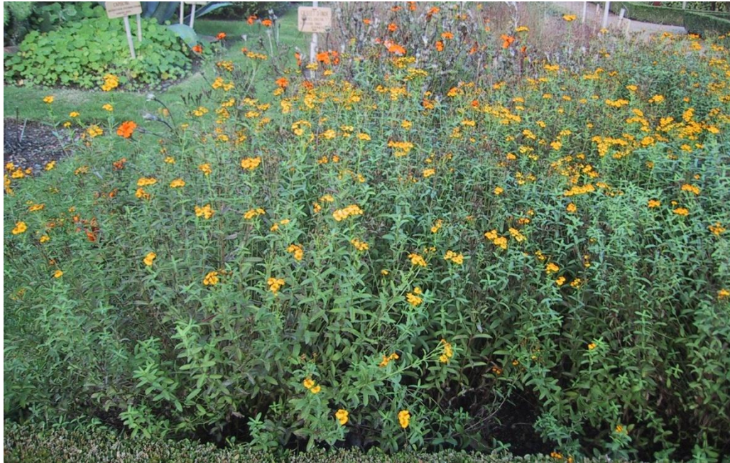
Tagetes lucida Mexican Marigold