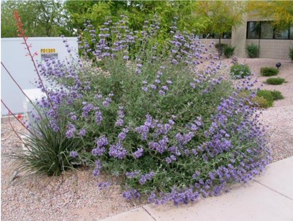
Salvia clevelandii Cleveland Sage