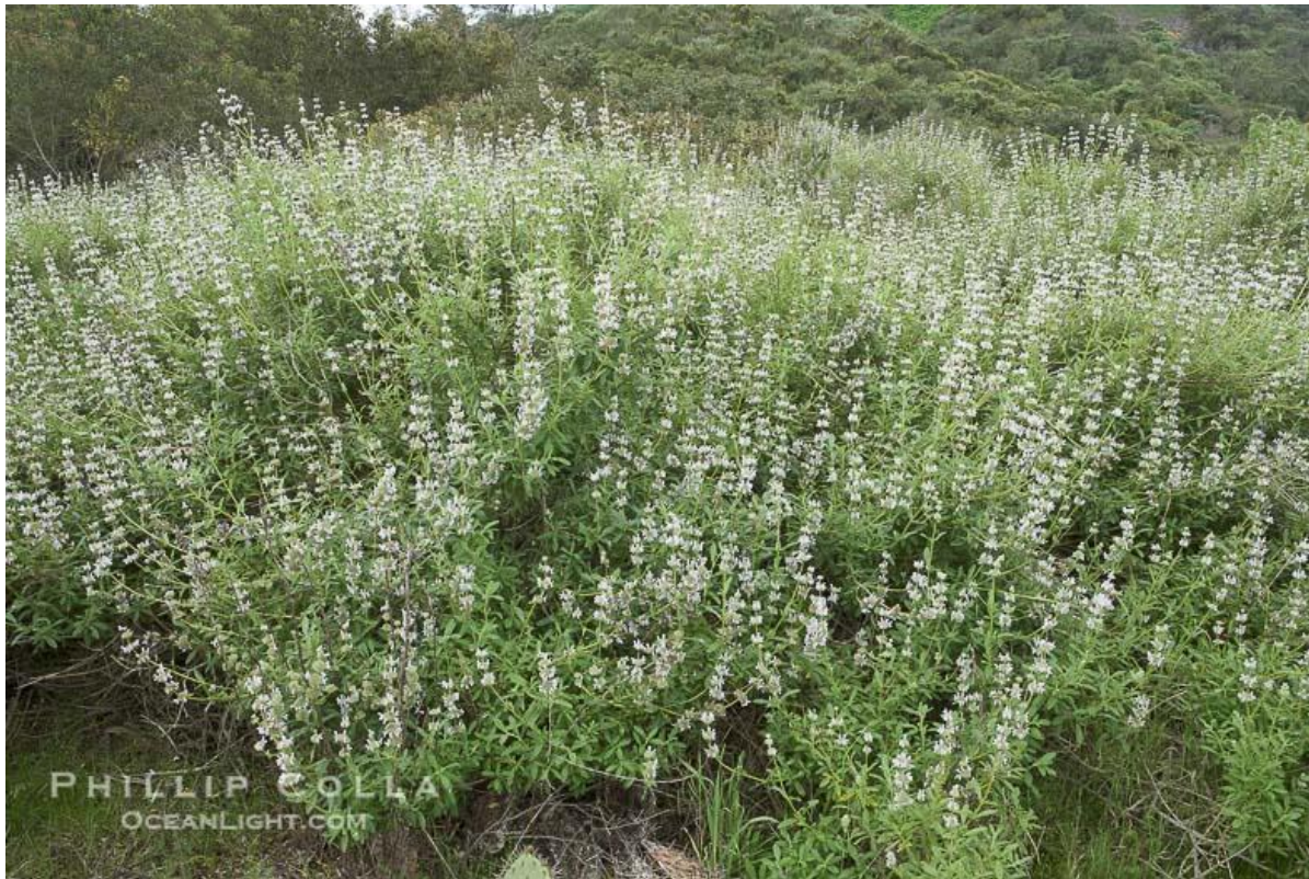
Salvia mellifera Black Sage