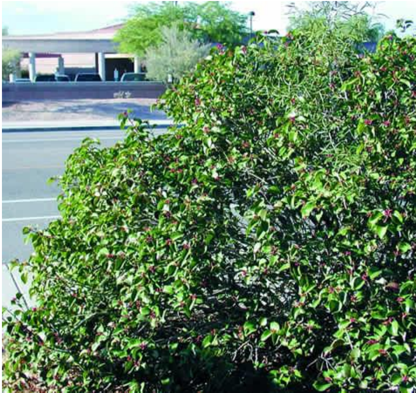
Rhus ovata Sugarbush